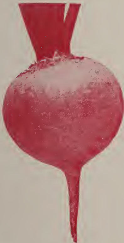
Beet—Detroit Dark Red

STRINGLESS GREEN POD. A stringless green pod bush bean. Surpasses all others in crisp, tender flavor. Finely shaped, long green pods, absolutely stringless. Of immense value to market gardeners and amateurs who seek an early bean. Packet, 10c; \frac{1}{4} lb., 15c; lb., 45c; 5 lbs., $1.75; 15 lbs., $3.50; 60 lbs., $12.00.